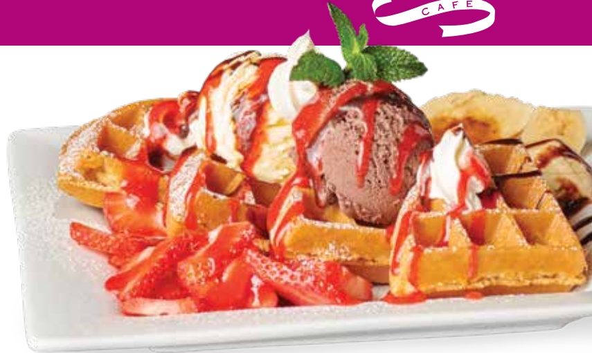
East Meets West™ Waffle

Visit the Cake Showcase to see today's complete cake selection Whole cakes available for purchase & take out