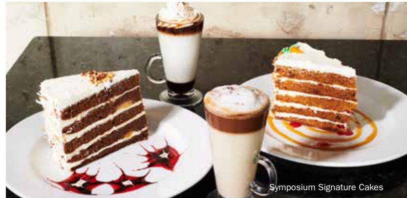
Symposium Signature Cakes